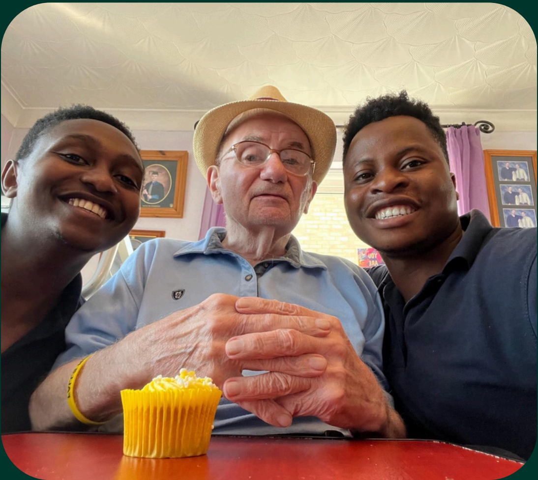
WE TOOK COOL PICTURES TOO