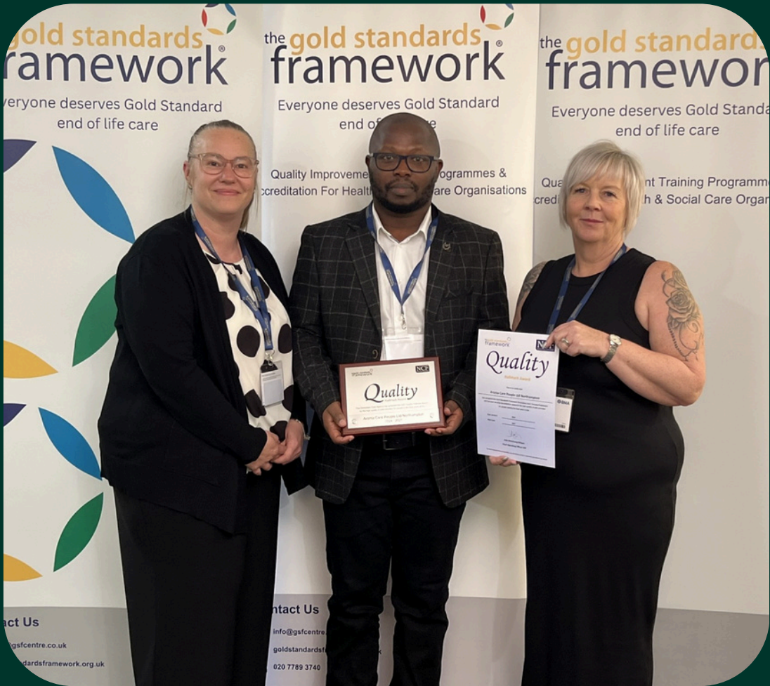
THE GOLD STANDARDS FRAMEWORK END OF LIFE CARE ACCREDITATION NORTHAMPTONSHIRE