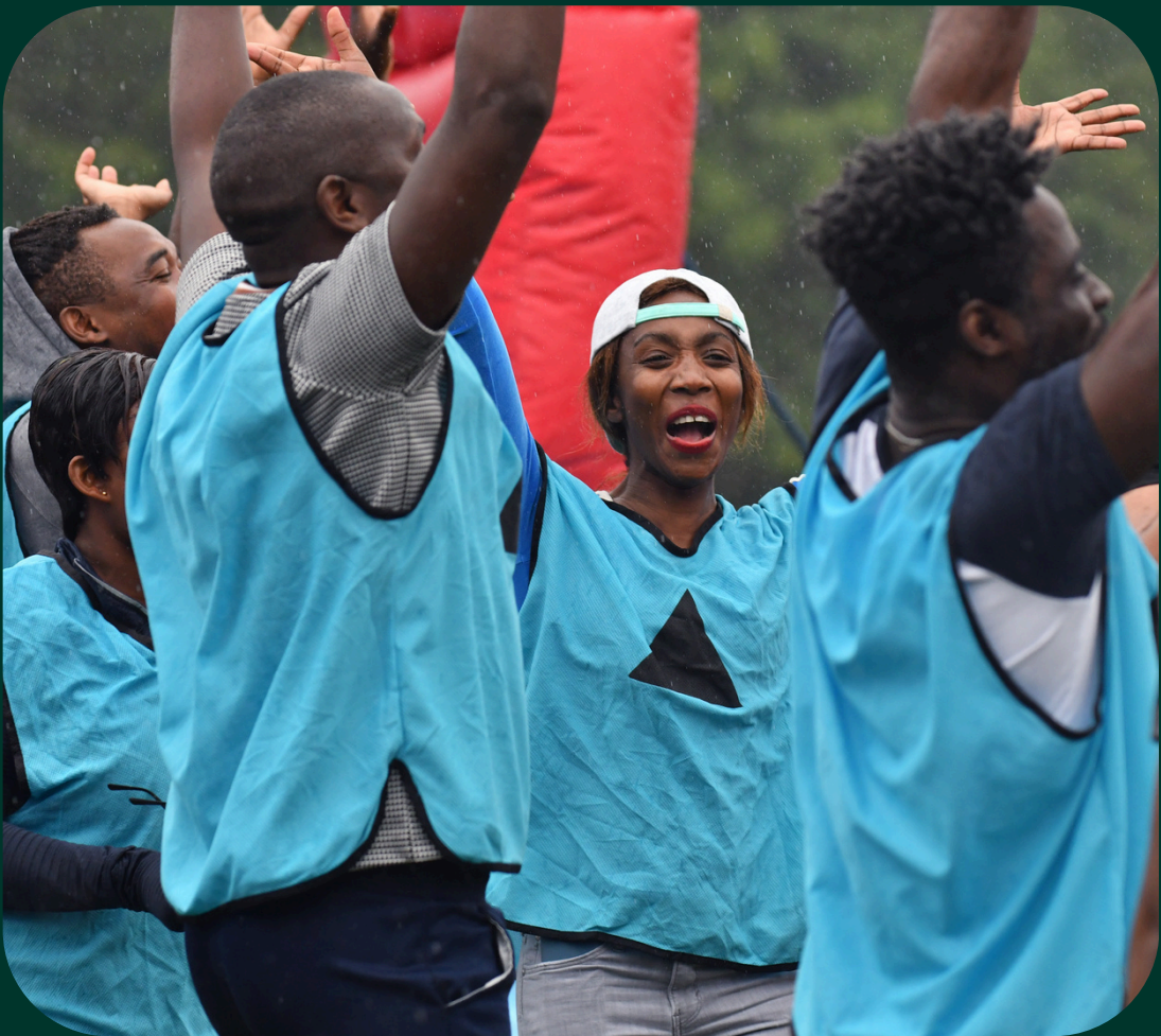
OUR TEAM COMPETED IN THE RAINBOWS TOTALLY WIPE OUT